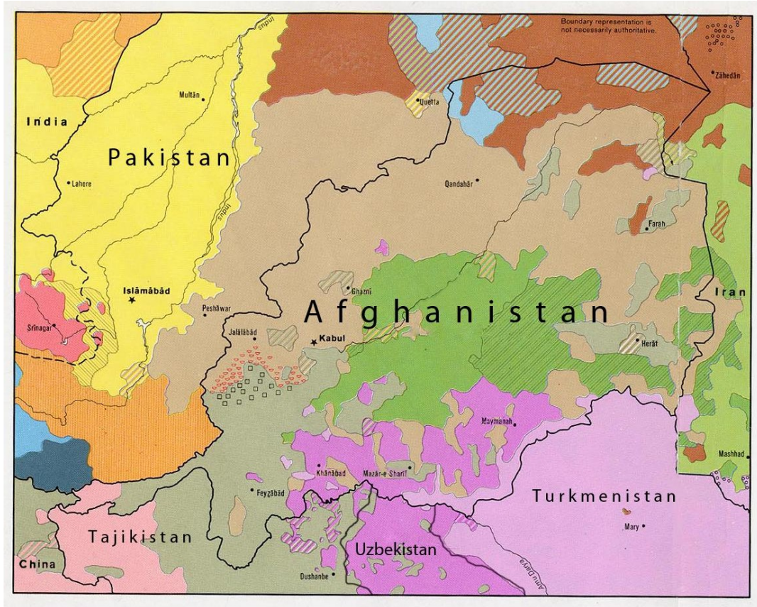
Ethnic Mosaic of South Central Asia (Note: South is pointing up to symbolize a different look)